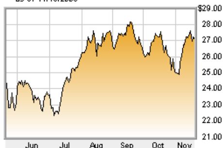
HOME DEPOT INC as of 11/19/2009